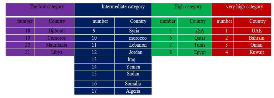
Figure 5. The ranking of ranked among the Arab countries When comparing e-government services index

The Ministry indicated that the e-government services index is measured by the member states filling out the e-government services form, as the organization adopts a specific and unpublished methodology for how to calculate the rate of progress or decline for countries in this indicator, and this form was submitted in March 2019 Where Jordan ranked twelfth among the Arab countries, as shown in the following (5).