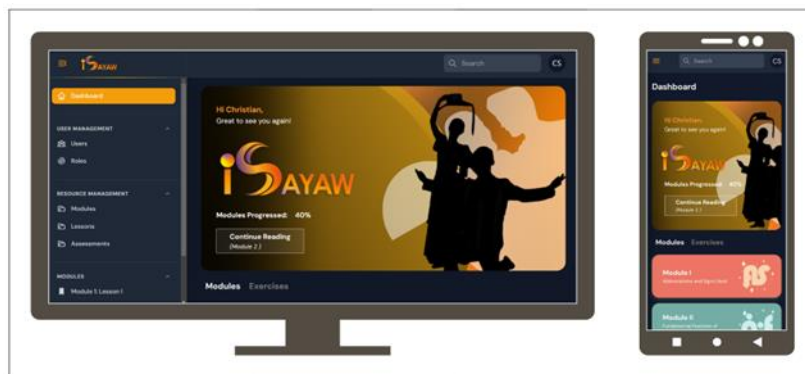
Figure 3. The iSAYAW Web Application Student User Interface

Education is a lifelong process that shapes the quality of life of an individual. Whereas, developing teaching-learning materials is one of the significant aspects of promoting student learning which helps achieve academic goals and objectives (Kapur, 2019). Lewis (2016) noted that teaching-learning materials (TLM) encompass a wide range of educational materials that teachers use within the classroom to support the targeted learning objectives that