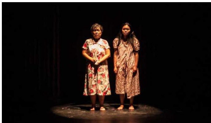
Figure 1. The Old Rosa and Young Rosa

Future research must examine audience reception and how plays like Nana Rosa feed into broader gender justice movements both in the Philippines and globally.