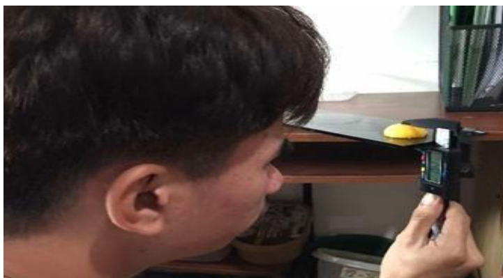
Figure VII. Measuring yolk height and diameter.

(Egg length and width were measured using vernier caliper.)