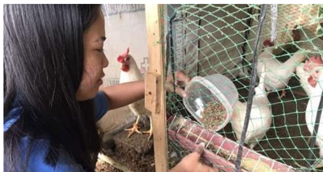
Figure V. Administration of live black soldier fly larvae (treatment).

kilogram of commercial feeds, respectively. Feeding live larvae directly was employed in this study and provided from the start until the termination of the study with daily replacement of unconsumed feeds (Figure V).