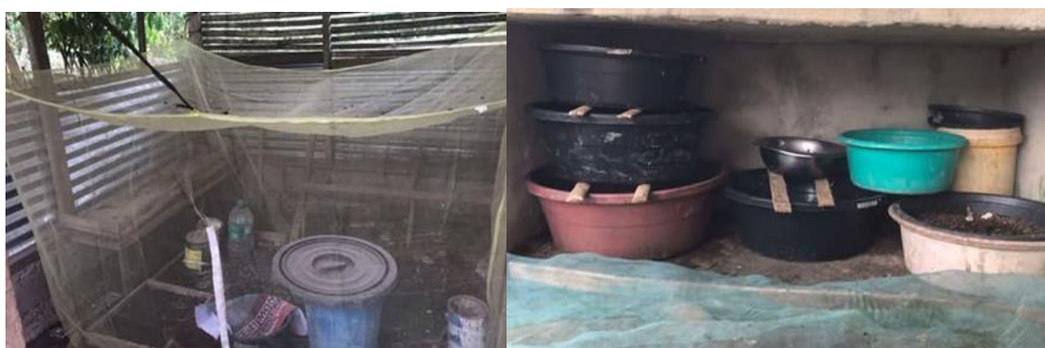
Figure III. Breeding cage and production set up.

After a few days, the eggs hatched into tiny larvae. Fresh batch of organic waste was provided for the growing larvae. Mature larvae were harvested when they reach the desired size, typically within 10-15 days.