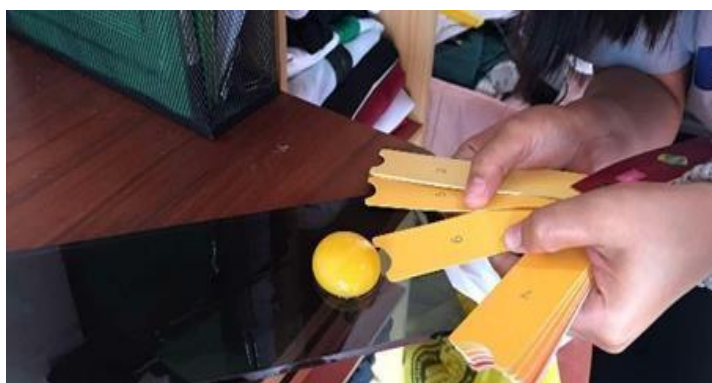
Figure VIII. Identifying yolk color using color fan.

The yolk color intensity was evaluated and scored according to the yolk color fan/chart.