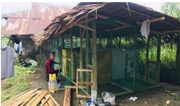
Figure II. Construction of experimental cages.

Cages were thoroughly cleaned and disinfected before the introduction of chickens to the respective area to prevent illness and diseases.