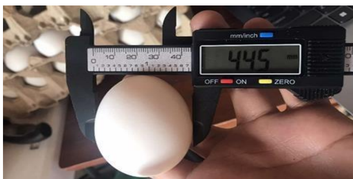
Figure VI. Measuring egg using caliper.

(Egg length and width were measured using vernier caliper.)