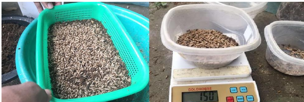
Figure IV. Harvested black soldier fly larvae.

tinuous larval production. Hygiene and sanitation were maintained throughout the process to prevent contamination and ensure the quality of the larvae as chicken feed.