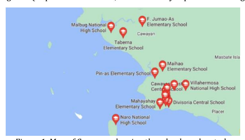
Figure 1. Map of Cawayan showing the schools under study

The research was conducted in Cawayan, Masbate, which is comprised of 42 elementary and 7 secondary public schools. The elementary schools were divided into two districts, the east with 24 schools and the west with 18 schools. A map of Cawayan showing the schools under study is presented in Figure 1.